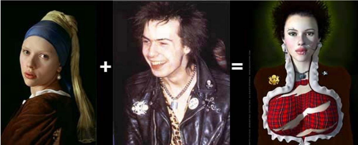
Scarlett Johansson + Sid Vicious = Pretty Vicious

“What Pretty Vicious is wearing, he replied, and her punk look was based on pictures of Sex Pistols’ bass player and vocalist Sid Vicious who died in 1979 after overdosing on heroine. Her facial features, especially the big lips, are based on Scarlett Johansson the actress who starred in the ‘Girl with the Pearl Earring.’